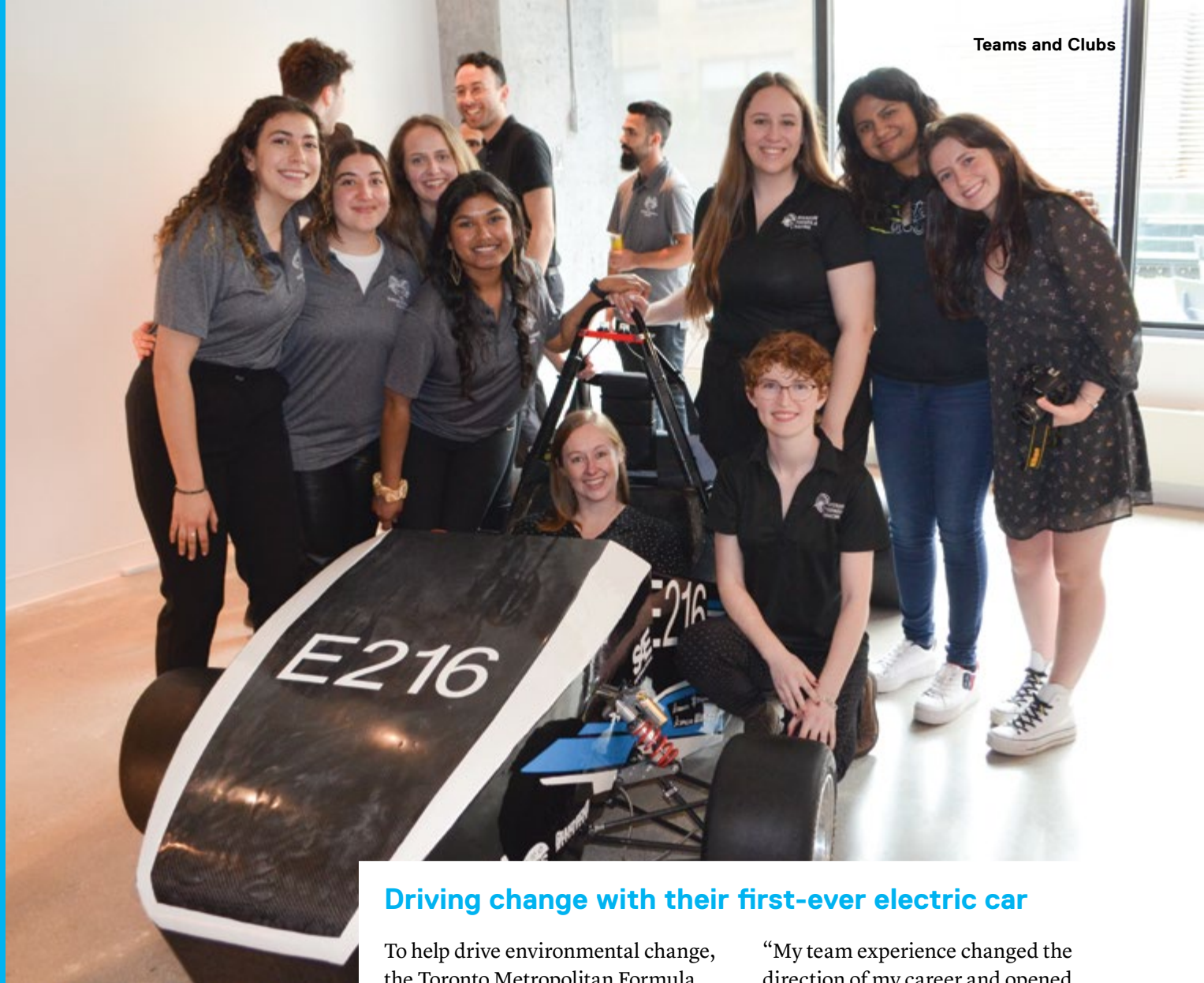
Above: Toronto Metropolitan Formula Racing team members apply classroom lessons to practical applications, creating a complete learning experience.